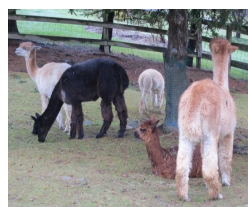
a few friendly alpacas